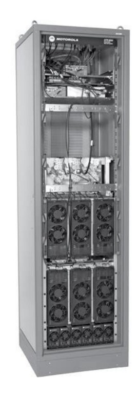
Figure 1-1: GTR Expandable Site Sub-System (ESS)

The Walton Lane Simulcast remote site has to operate in the 700 MHz band similar to the temporary site that is in place today at Carguinez and therefore will continue to reuse the existing combiners and multicoupler with the channels retuned.